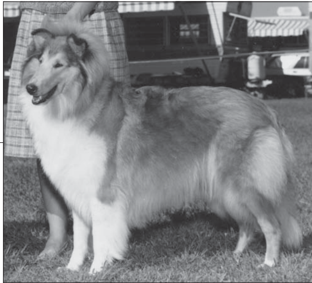
Ch. Amberhill's Bouquet Of Chelsea