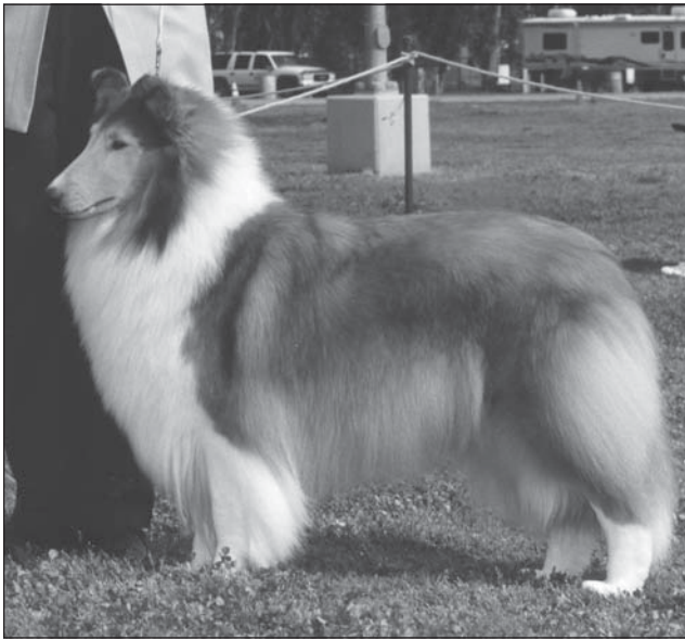
Ch. Chelsea Summer Blonde, HIC