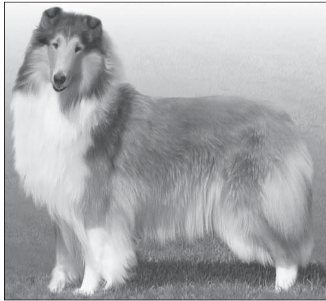
Ch. Chelsea The Crown Jewel, HIC

I rarely special my dogs once they are finished because I have always favored showing class dogs.