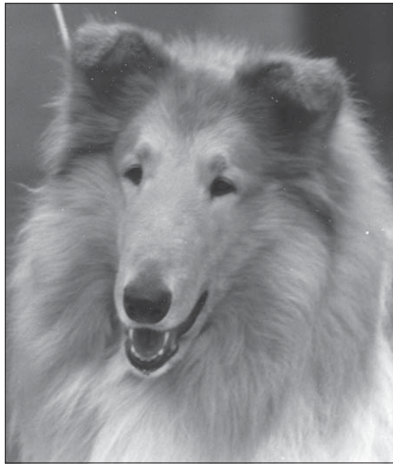
Ch. Chelsea Shadowgold

I was so pleased with the quality I was getting from Advantage of Arrowhill that in 1980 I bred Chelsea Moonshadow (my Battle Chief/Gold Mist daughter) to him and got one of my biggest winners to date. Ch. Chelsea Shadowgold finished with two five-point specialty majors, all from the Bred-By class, before the age of two. Those were the days of huge Collie entries when the average specialty show had class entries of 60 to 80 bitches. The only time specialed, she won the large Nor-Cal District Tournament, but ended up not going to the National. She is behind all my current dogs and remains even twenty-five years later, my ideal of the type of Collie I want to breed. She was sound, typey,