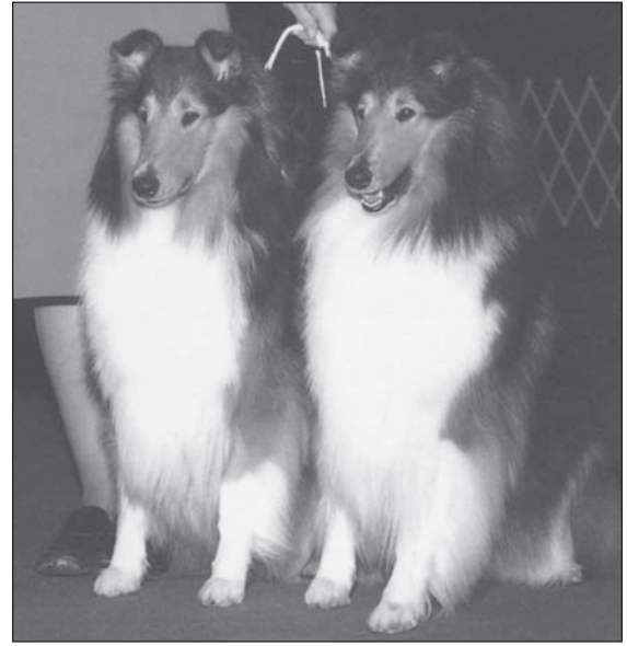
Ch. Chelsea Elean Crowning Glory, HIC and Ch. Chelsea Elean The Crown Princess, HIC

you lose dogs or puppies before their time. Dog breeding separates the men from the boys and the discouragement is probably the biggest reason fanciers come and go within a few short years. This sport is not for the “faint of heart.” Staying in dogs takes patience, persistence, dedication, and determination. You just have to pick yourself up... and stay focused.