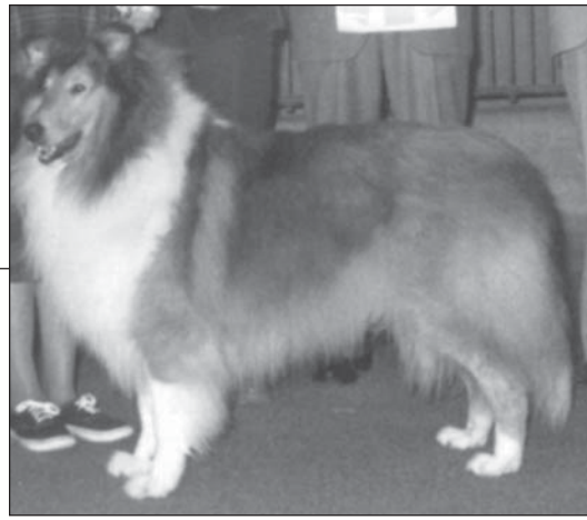
Ch. Advantage Of Arrowhill