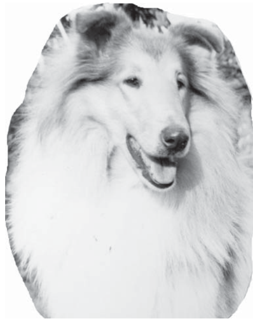
Ch. Chelsea Gold Mist, whelped in 1973