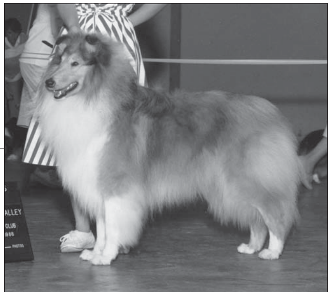
Ch. Amberhill's Chips Of Gold