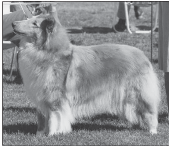
Ch. Chelsea Castles In The Sky

dogs ended up winning at the same specialties. Touch was extremely elegant with great style and presence. I was hoping to gain elegance and shorten the bodies somewhat, while keeping the head details. Selecting for head length has forced me to keep a constant vigil on body length. From the resulting litter, I kept an elegant, full-bodied, beautifully coated, big-muzzled bitch, Chelsea Blonde Ambition. Bred to the above-mentioned Chelsea City Squire, she produced my current male, Ch. Chelsea The Crown Prince,