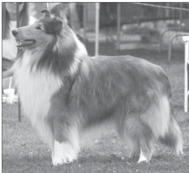
Chelsea City Squire