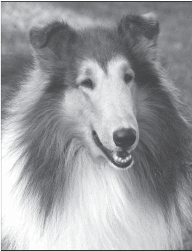
Ch. Chelsea Luck Of The Draw