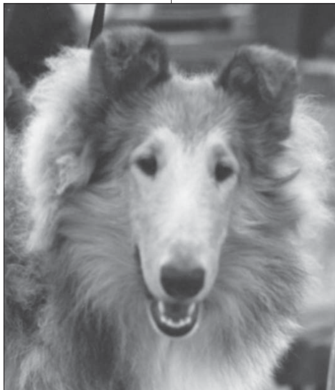
Squire's Chelsea Imprint