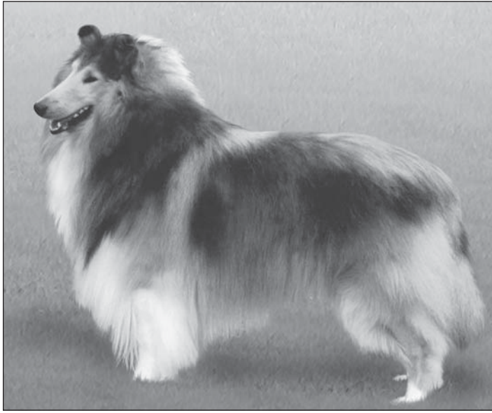
Ch. Chelsea T' Crown Heir Of Squire, HIC