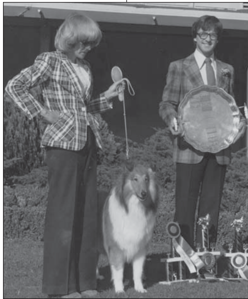
Ch. Chelsea Ice Castles