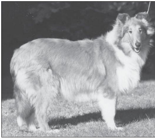
Chelsea Summer Breeze