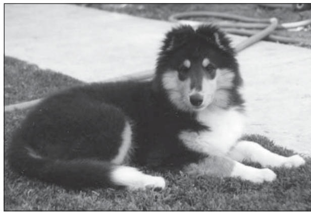
Ch. Chelsea Charidan Carte Blanc, HIC