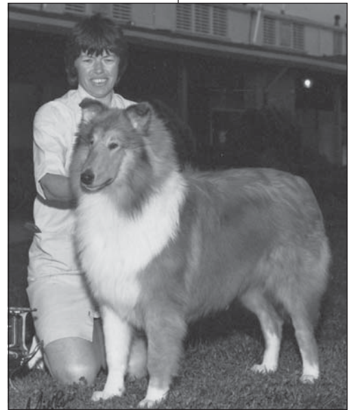
Ch. Chelsea Of Arrowhill

the bitches, two males in particular caught my eye: the tricolor stud, Ch. Jude Of Arrowhill, and one of my all-time favorite Arrowhill dogs, Ch. Advantage Of Arrowhill.