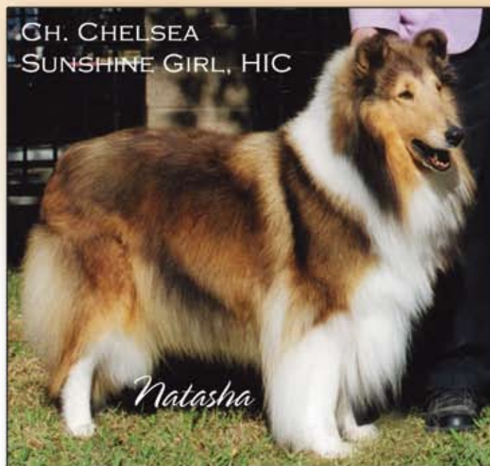
CH. CHELSEA SUNSHINE GIRL, HIC

FINISHED WITH 3 SPECIALTY MAJORS. BREEDER/OWNER HANDLED TO ALL HER WINS!