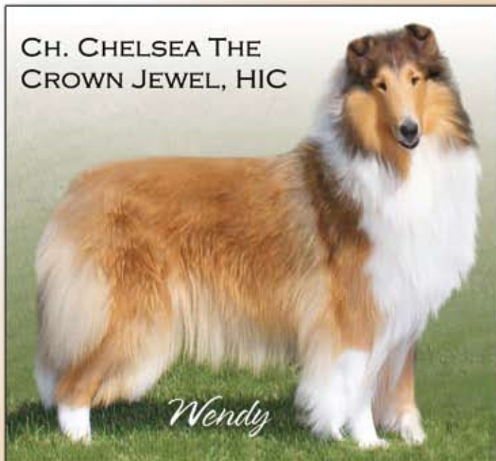
CH. CHELSEA THE CROWN JEWEL, HIC

POINTED AT 6 MONTHS, SHE FINISHED WITH TWO SPECIALTY WINS